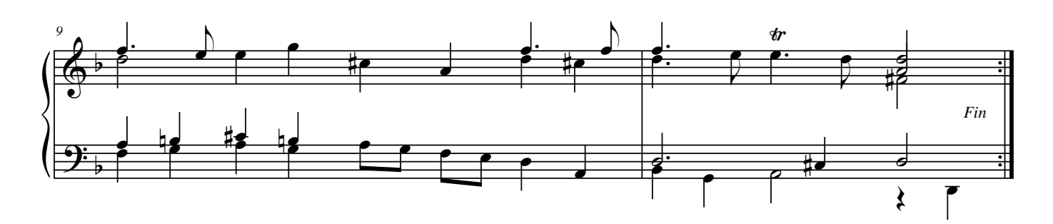
WEB LIBRARY OF SEVENTEENTH-CENTURY MUSIC (www.sscm-wlscm.org) Monuments of Seventeenth-Century Music Vol. 1.19