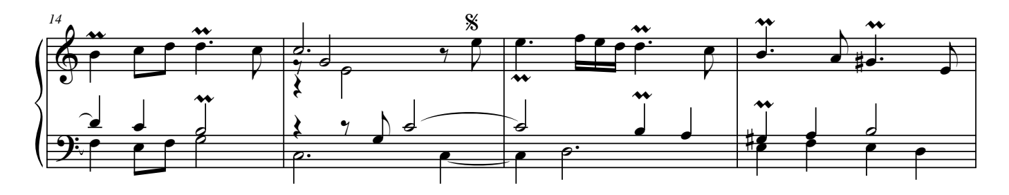
WEB LIBRARY OF SEVENTEENTH-CENTURY MUSIC (www.sscm-wlscm.org) Monuments of Seventeenth-Century Music Vol. 1.64