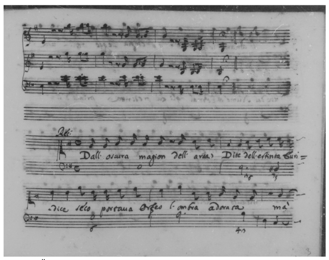
Figure 2: D-MÜs 3931: close of Introduttione , opening of Recitative 1.