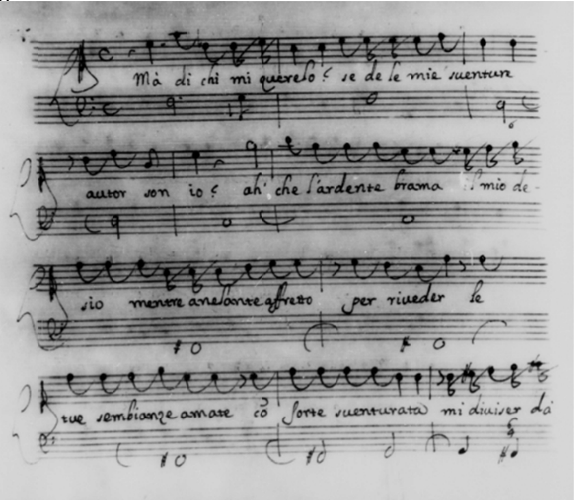
Figure 3: F-Pn D.11857, f.180: L'Orfeo , Recitative 5, f.180.

The scribe of L'Orfeo in F-Pn D.11857, though much less well known and thus far undocumented in Scarlatti source study, has nonetheless an equal claim to be considered as a copyist who worked from the composer's material. There is one cantata in this manuscript which may be checked against the autograph, La beltà ch'io sospiro (see above, Fn.6). In every particular of figuring, clef changes (bass / tenor clef in the bass part) and other indications, this copyist's reading in F-Pn D.11857 /17 matches that of the autograph—a remarkable case of exact copying given that the composer's extremely full figuring was almost invariably reduced by subsequent copyists of his music. The other extant copy of La beltà ch'io sospiro , in GB-Lbl 29249, ff.68–75, matches the autograph less closely, with added vocal slurs, some figures missed, and a missing tempo indication, so that the Pn copy cannot be considered a derivative of this source. It is most likely that the copy in F-Pn D.11857 was copied from the composer's autograph. The page of recitative (Fig. 3) shows the characteristic C clef and stave brace of this copyist.