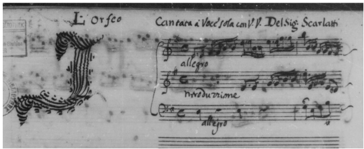
Figure 1: D-MÜs 3931: opening measures with title and ornamental capital.