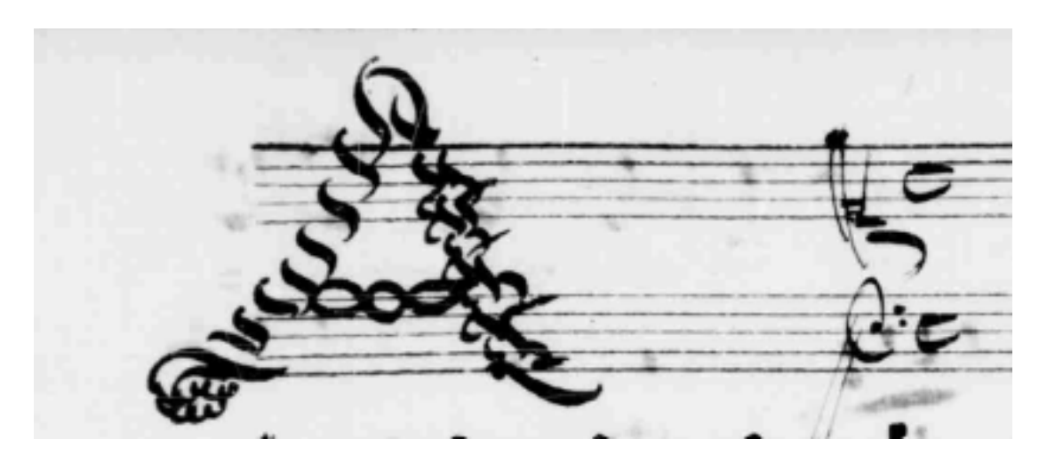
Figure 2: D-Dl Mus.1-I-2,2, [p.220], capital "A", on stave lines. A voi che l'accendeste , A. Scarlatti. Reproduced by kind permission of D-Dl .

The style of the capital, as well as the flourish at the end of each cantata, appears to be in keeping with the copyist's work (for example, the C clef). The fact that the capital appears in each case also indicates that they were the work of the copyist, rather than being left for a professional illustrator who might or might not be engaged to carry out the work. <sup>25</sup>